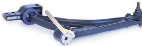
B Bush Front of car