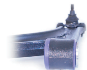
A Bush Rear of car