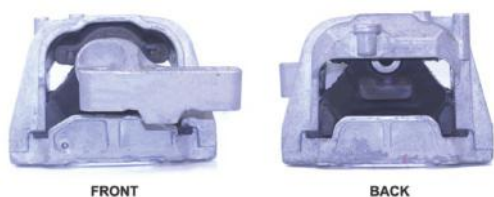
Figure 2 - profile of the Upper engine mount that uses this insert.