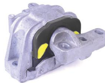
Figure 4 - showing all polyurethane inserts fitted inside the upper engine mount