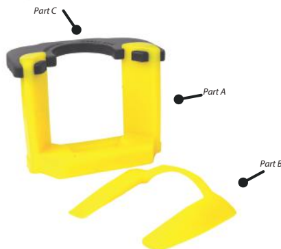
Figure 3 - showing how A and C polyurethane inserts should fit together