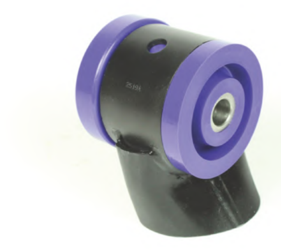
Figure 2 - Bush Fitted

sales@powerflex.co.uk www.powerflex.co.uk