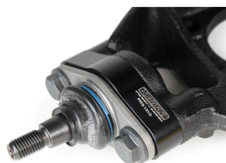
Figure 1- The roll centre adjuster unit without washer

6. Assemble the unit with the M10 bolts, and tension all hardware to manufacturers recommended torque settings.