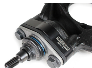
Figure 2- The roll centre adjuster unit with washer