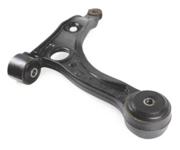
Figure 2 - showing all polyurethane bushes fitted in to the arm.