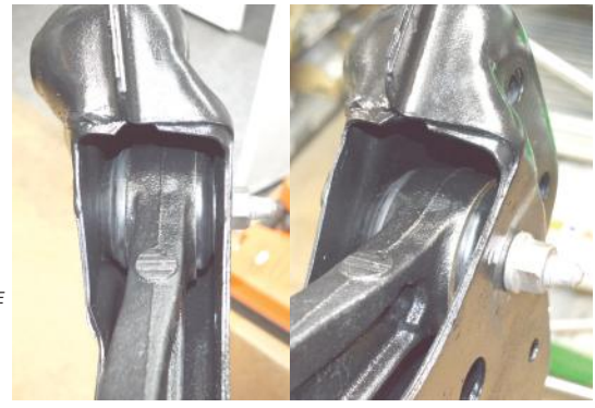
Figure 5 - showing the bush fitted on the subframe.