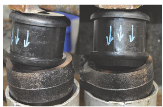
Figure 3 - showing how the bush fits into the arm.