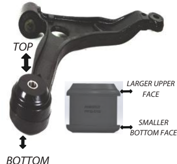
Figure 4 - showing the top and the bottom side .