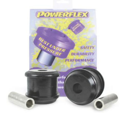
Figure 1 - showing the contents of the box