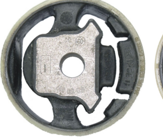
UP TO MID 2008