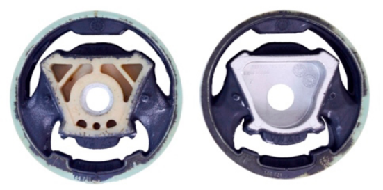
Use PFF85-832 Or PFF85-833 For OEM part number 5Q0198 037 B

In addition to the Road Series parts listed please check the Black Series website for other bushes suitable for this car that may be more suited to Track/Race use.