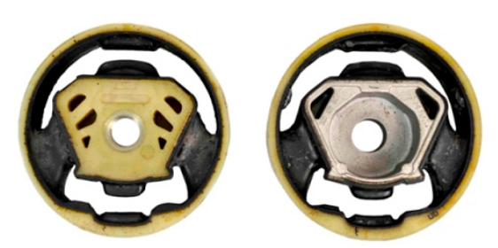
Use PFF85-830 Or PFF85-831 For OEM part number 5Q0198 037 A